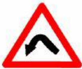
Left Hair Pin Bend