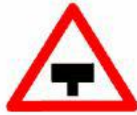
Major Road Ahead