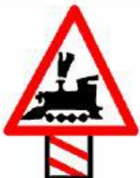
Unguarded Level Crossing / Railway Crossing