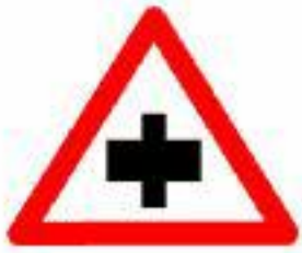
Major Road Crossing Ahead