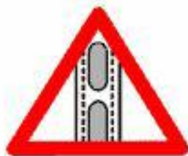
Gap In Median