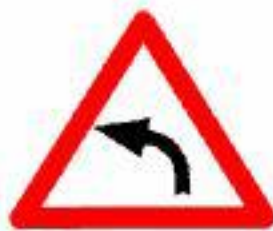
Left Hand Curve