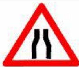
Narrow Road Ahead