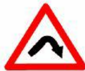
Right Hair Pin Bend