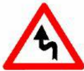
Left Reverse Bend