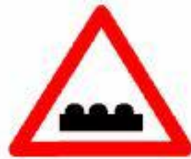
Hump or Rough Road