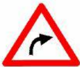
Right Hand Curve