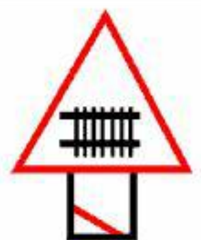
Guarded Level Crossing