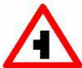
Side Road Left