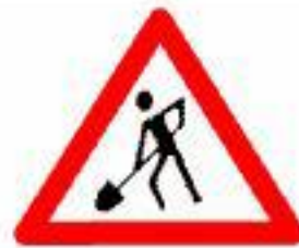
Men At Work